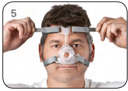
Unfasten the straps, pull the upper headgear straps evenly until they are comfortable and firm, and reattach the straps.