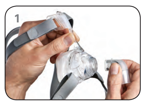
Prior to fitting the mask, remove the elbow from the mask by pressing the squeeze-tabs.