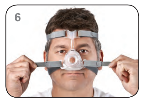
Repeat step 5 with the lower headgear straps.