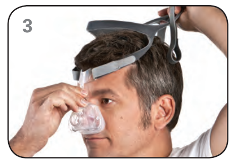
With both lower headgear straps released, hold the mask against the face and pull the headgear over the head.