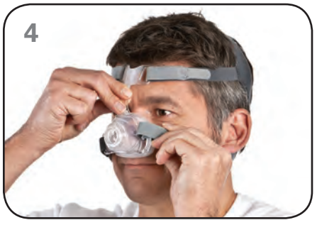
Bringing the lower straps below the ears, loop the headgear into the lower hooks on the mask frame.